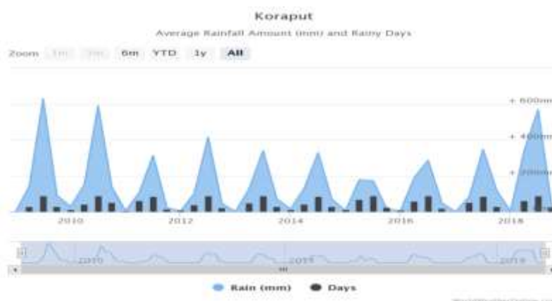
Figure-02: Rainfall data of koraput district in recent years:

It can be observed from the above figure that in 2010 the average rainfall was around 620mm and in 2011 it was quite nearer to that but in between 2012 to 2016 there were less rain fall which rose to around